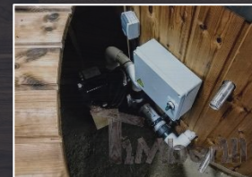
Electric 6kW heater with wooden cover